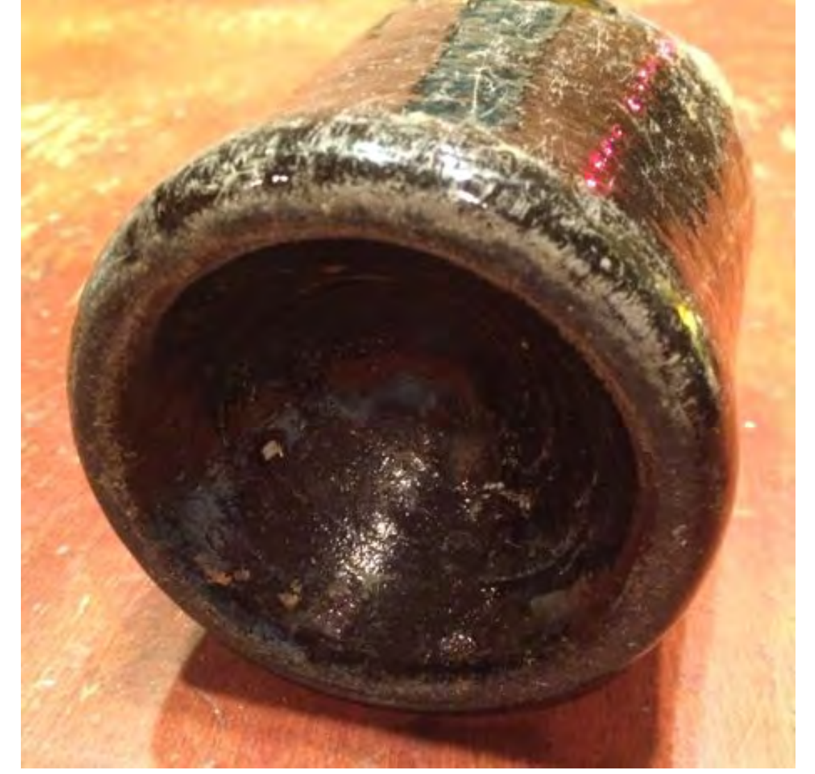
9" bottle c.1750. Wear marks indicate the bottle was picked up and put down tens of thousands of times (typically on soft wood tables) over decades.